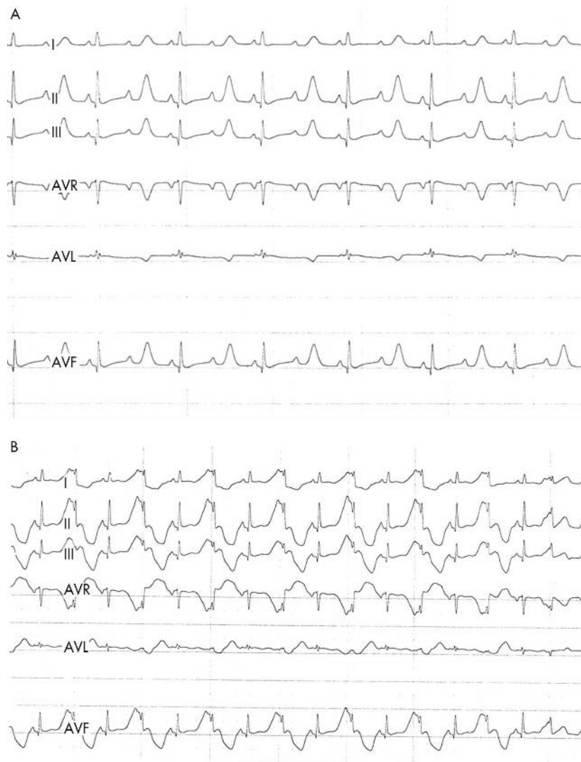
Figure 1 (A) This six lead rhythm strip from an infant with syndactyly and long QT syndrome shows gross prolongation of the QT interval. Two p waves are seen for each T wave. There is 2:1 atrioventricular block because the t wave has not even started when the next p wave appears; since ventricular repolarisation has not yet occurred, the ventricle cannot yet be depolarised again. This phenomenon has been reported in sudden infant death secondary to long-QT type 3. 37 (B) This six lead rhythm strip was taken from the same infant as in (A), moments later. The QT interval is very long, and the t wave is alternately upright and then inverted. Repolarisation is disordered and swinging like a pendulum in one direction across the myocardium and then another. This typically precedes torsades de pointes.